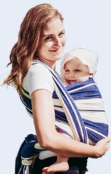
Baby Wrap Sling